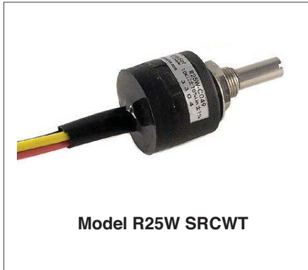
Model R25W SRCWT